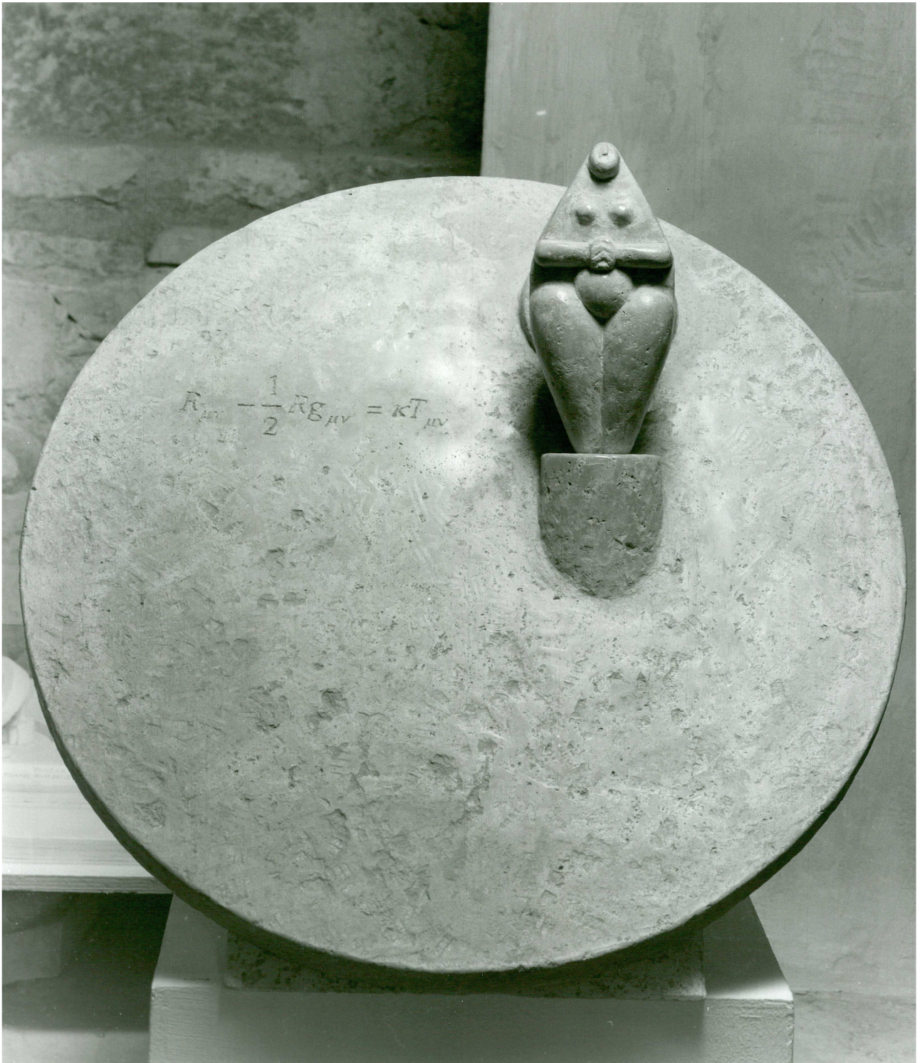
“The Great Mother Earth in the sky” bozzetto n. 4